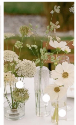
Table Center Pieces

3 BUD VASES AT CENTER OF TABLE WITH 3 GOLD CANDLESTICKS PROVIDED BY BRIDE